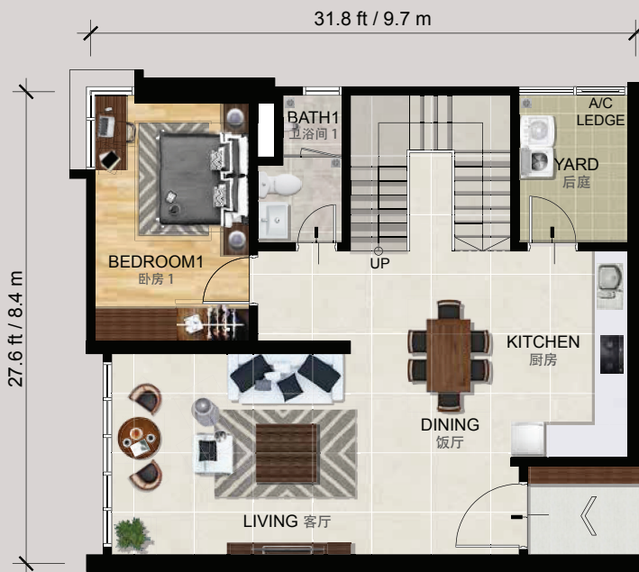
LOWER FLOOR 下层