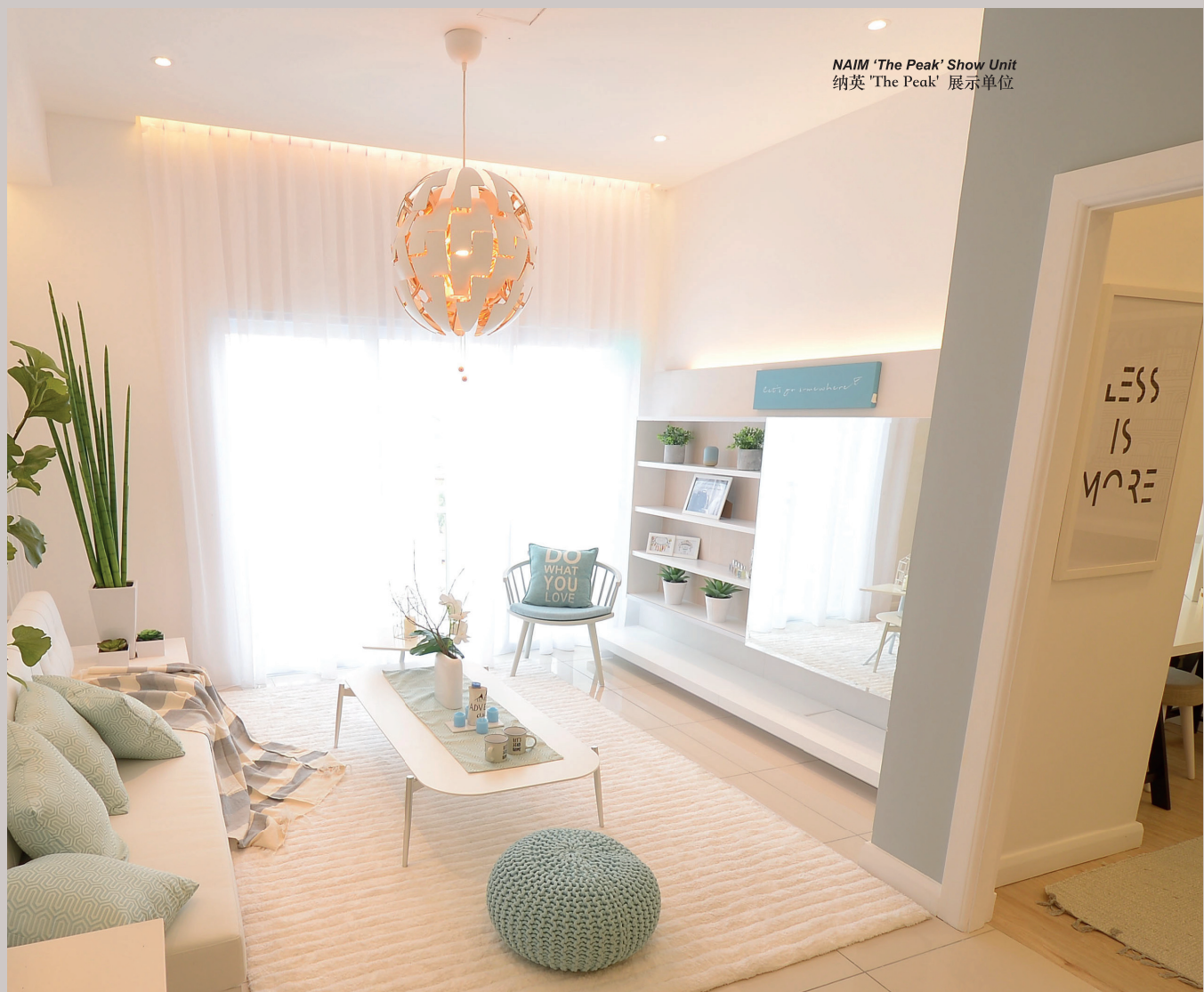
NAIM 'The Peak' Show Unit 纳英 'The Peak' 展示单位