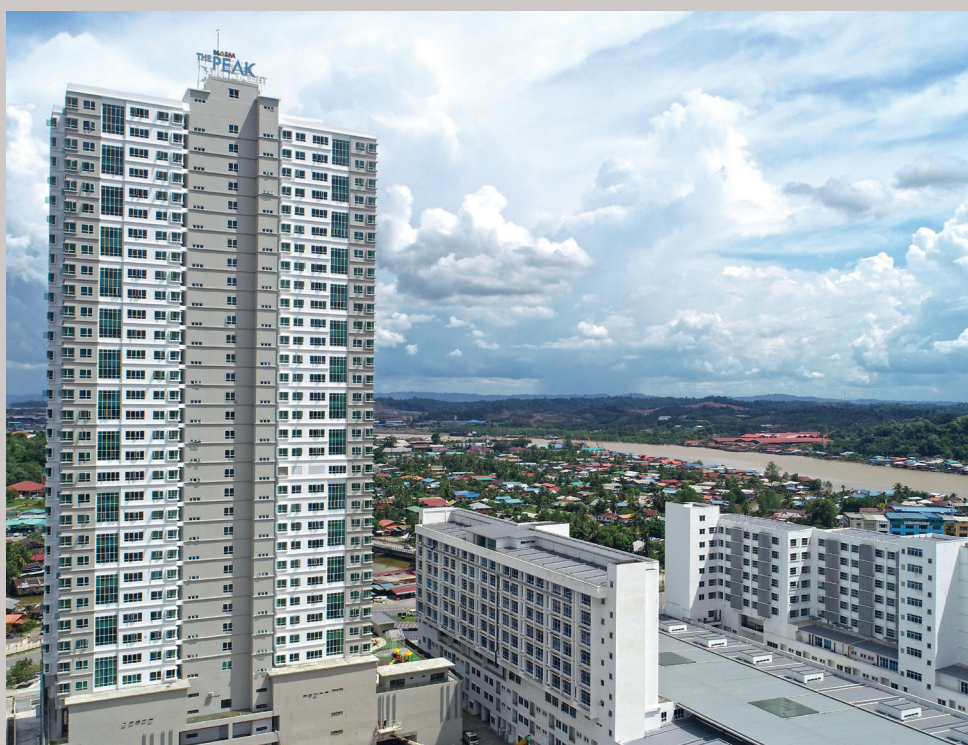
An iconic tower – The tallest condominium in Sarawak 拔地而起的地标 – 砂朥越州最高的共管公寓