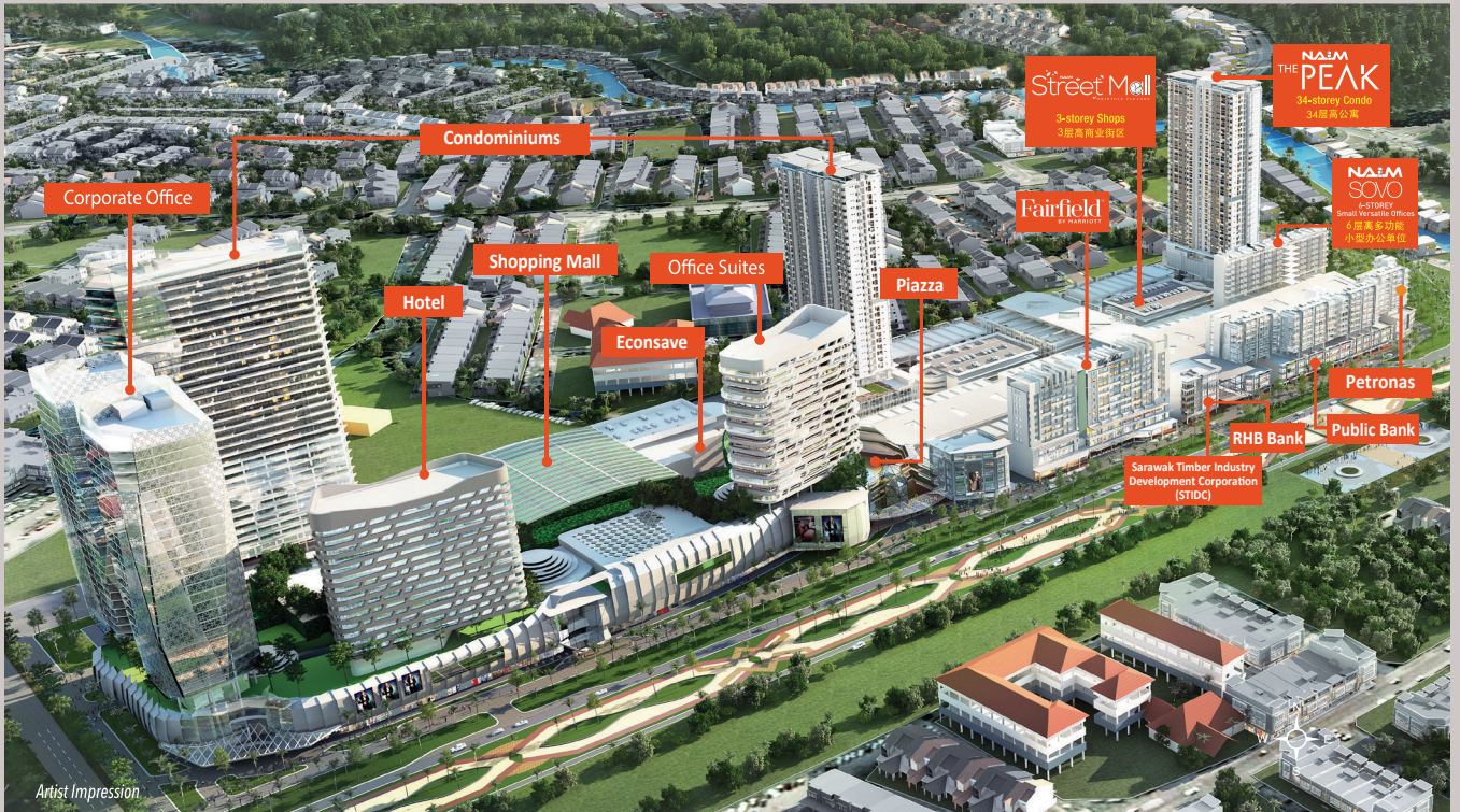
PHASE 2 第2期工程