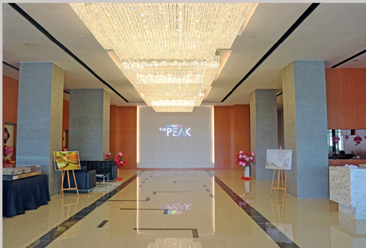
Grand Lobby 宏伟的大堂