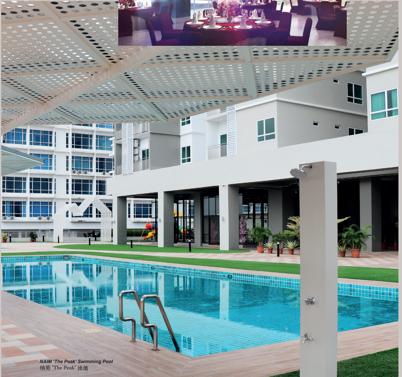
NAIM 'The Peak' Swimming Pool 纳英 'The Peak' 泳池

ALL THE FACILITIES AND MORE, JUST FOR YOU. 为您贴心而设的：