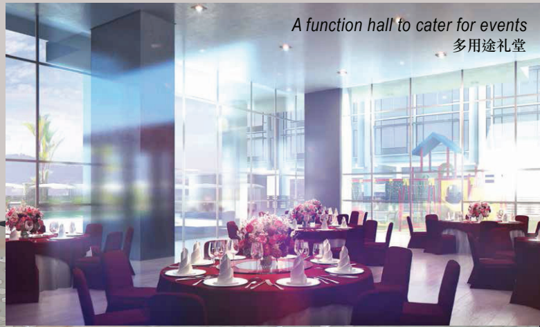
A function hall to cater for events 多用途礼堂